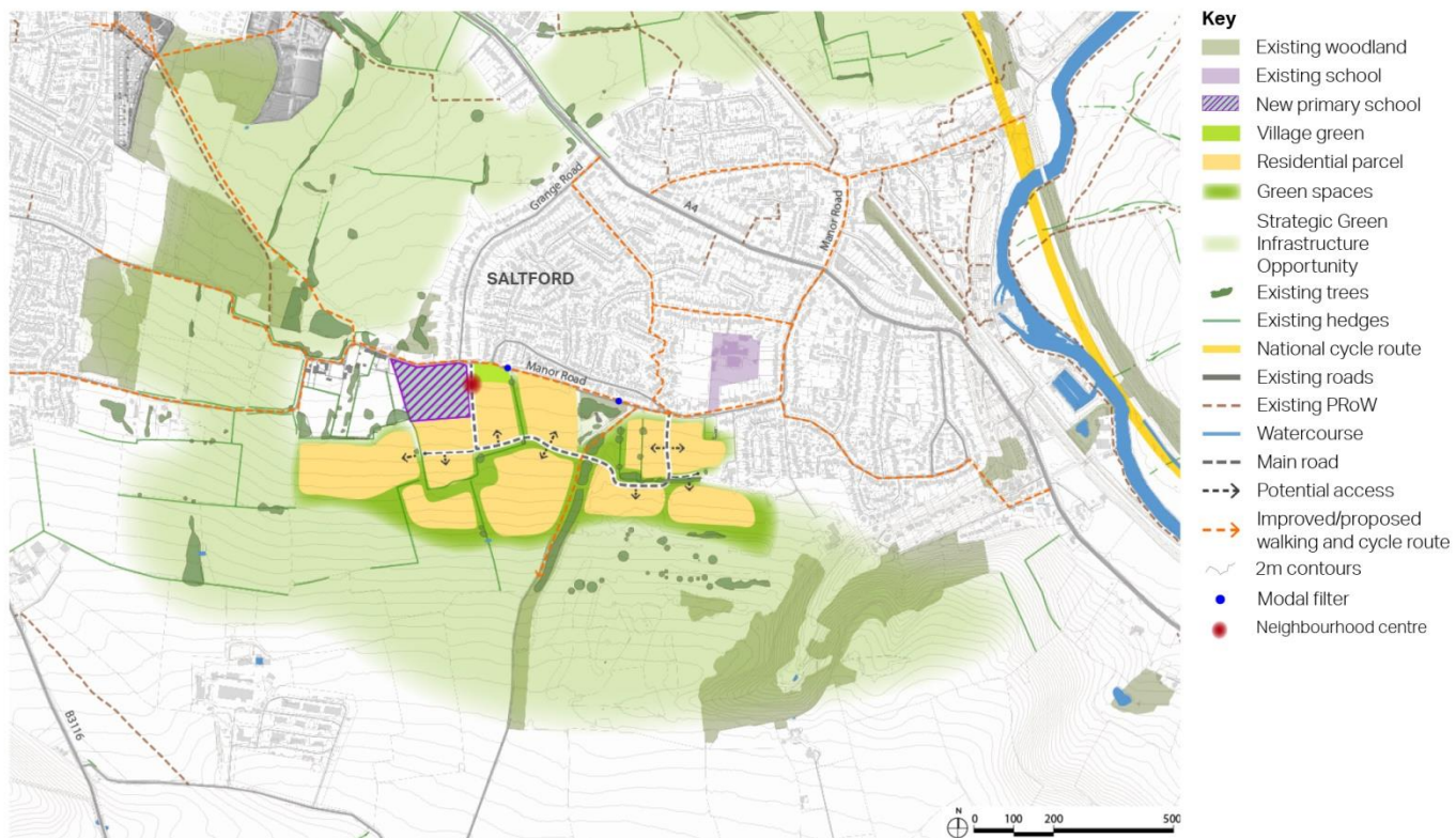
South Saltford Option (800 houses + new school)